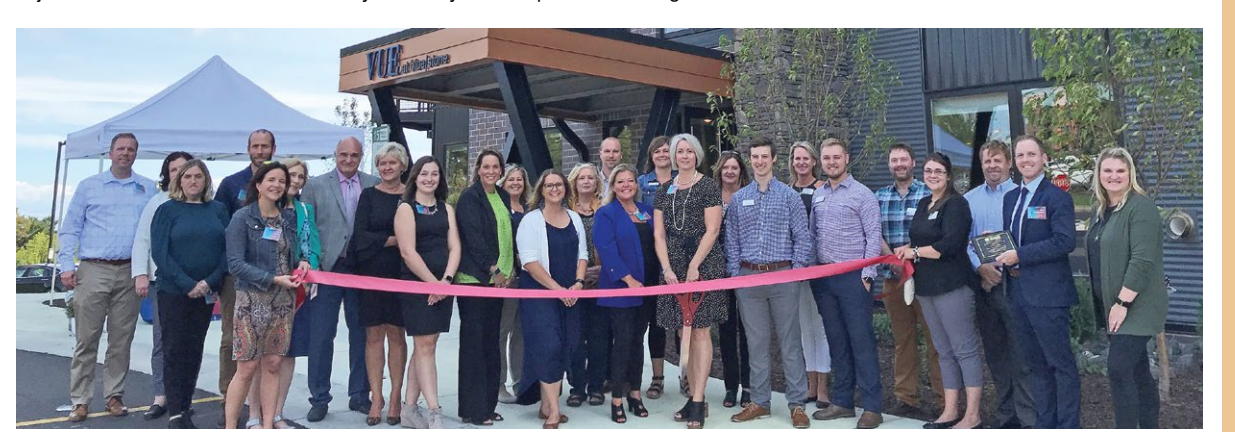
The grand opening celebration for Vue at BlueStone, developed by Summit Management to provide upscale multigenerational apartments (120 Summit St.).

Duluth Edison Charter School (DECS) celebrates its new160-acre Outdoor Education Space at the Snowflake Nordic Ski Center site adjacent to DECS's North Star Academy.